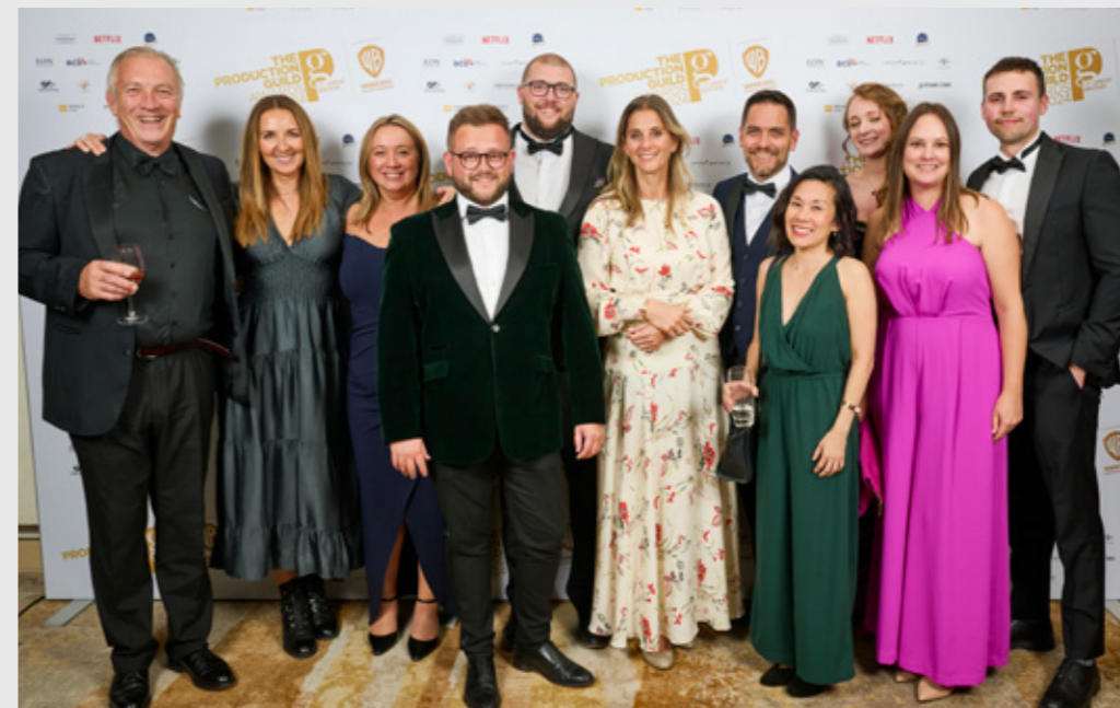
The WB team at PGGB Awards

KAI Consulting “As a platinum partner, Netflix is immensely proud to celebrate 25 years of The Production Guild of Great Britain, which has been a consistent champion of excellence in film and television production. It’s vital to have an institution that represents production across the UK in such a vibrant and dynamic sector. PGGB’s focus on supporting freelancers, who are the heart of our industry, is especially valuable.”