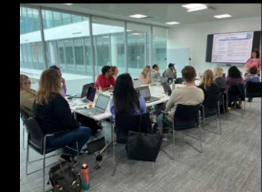
Entertainment Partners Photos (clockwise) 01 - Step Up to 1st AA - Aug 24 02 - SUPA - Glasgow - April 24 03 - Step Up to Assistant Accountant July 24 04 - TDF Year One Drinks 05 - BCD- PGGB Awards Photo