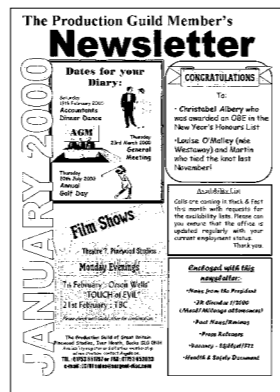
The first year's newsletter (2000)

From those humble beginnings, PGGB now has over 1,000 members across the accounting, production, locations and VFX grades, as well as the recent addition of sustainability co-ordinator. Over the years, PGGB has adapted to the highs and lows of the industry and remains as solid as ever, ready to support its members in the next phase of an ever-evolving landscape.